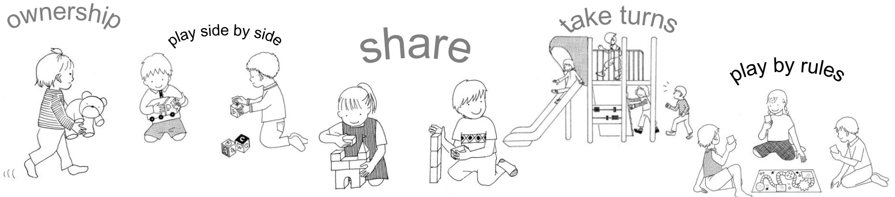
A young child learns by interacting with other people